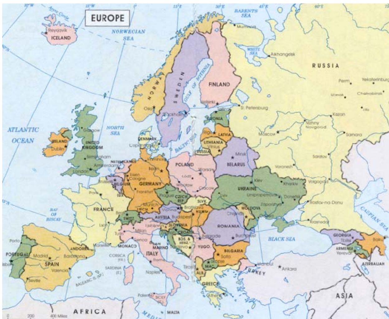
FIG. 1. Location of Sweden in Europe.

Sweden is a long narrow country in the northern part of Europe and borders Norway in the west, Finland in the northeast and the Baltic Sea in the South and east, as shown in Figure 1. The total length from north to south is 1,600 kilometres and the land area is 410,932 square kilometres. The size of the area is the third in Western Europe after France and Spain. The area is almost twice as big as that of Great Britain. The northwest part of Sweden consists of mountains with a slope towards the east. There are many rivers in the north and lakes are scattered all over the country. Sweden's coast line is more than 2,000 kilometres long.